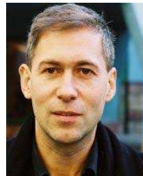
Kai Konrad Max Planck Institute, Munich